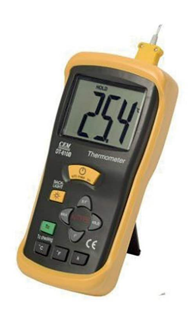
Fig. 1.2 for Question 1 Digital thermometer